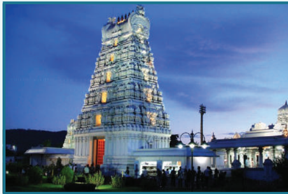
KALYANA VENKATESWARA TEMPLE