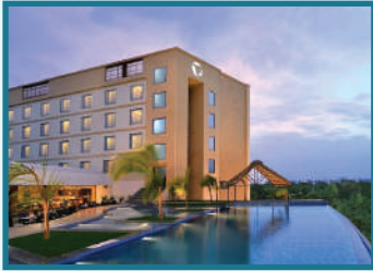
FORTUNE SELECT GRAND RIDGE