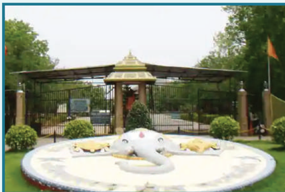
SRI VENKATESWARA ZOOLOGICAL PARK