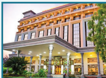
THE BHIMAS RESIDENCY